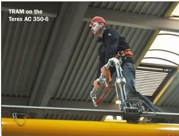
TRAM on the Terex AC 350-6

Recognising the hazards of working at height, Terex Cranes is removing the need to work at height on its newest mobile crane designs. For example, on its new Challenger 3160, a 55-tonne capacity truck crane, all the rigging can be assembled from ground level. On larger cranes, the same principles are being applied, although it is not possible to totally eliminate the need for riggers to work at height.