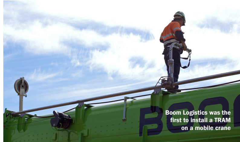
Boom Logistics was the first to install a TRAM on a mobile crane